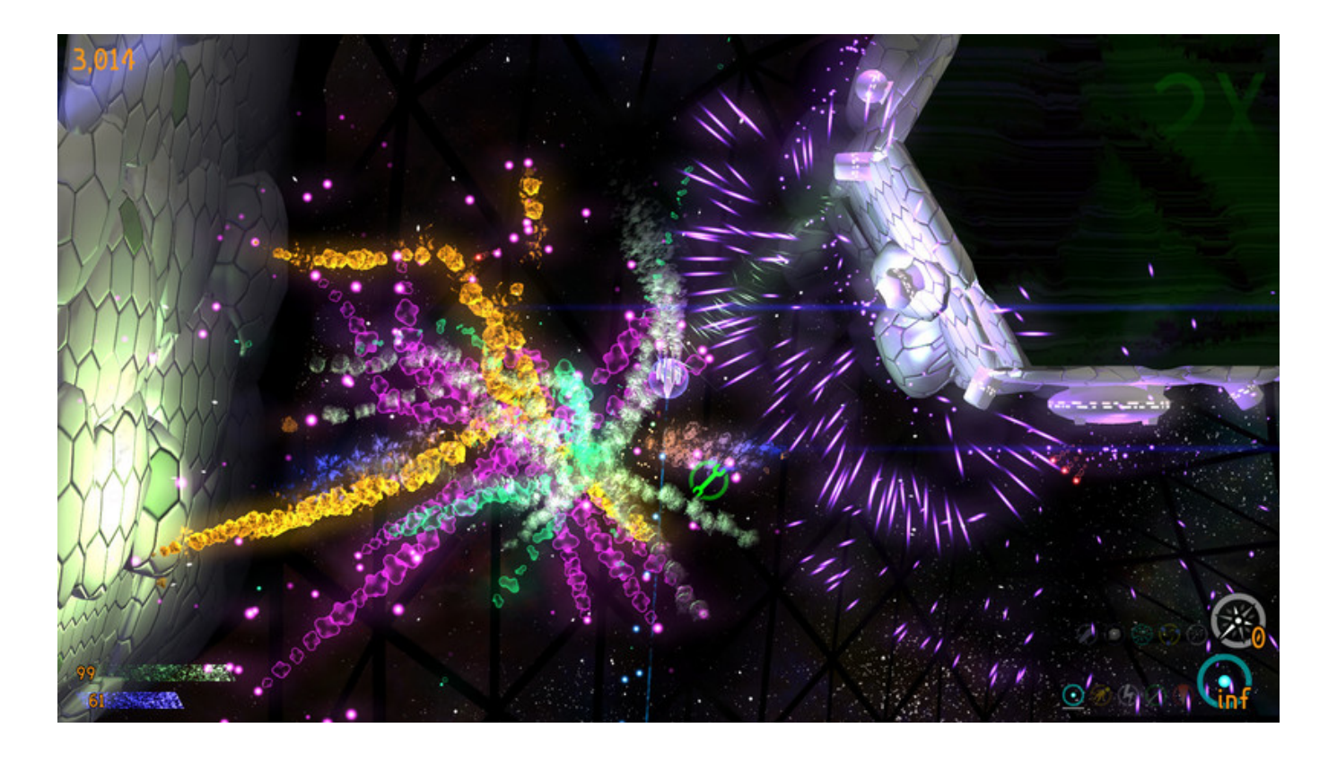
Download ->->-> http://bit.lv/2SHIgKS